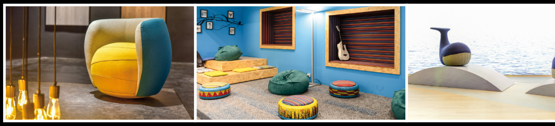
An emphasis on colour, for offices that are atypical and redesigned to meet new needs.